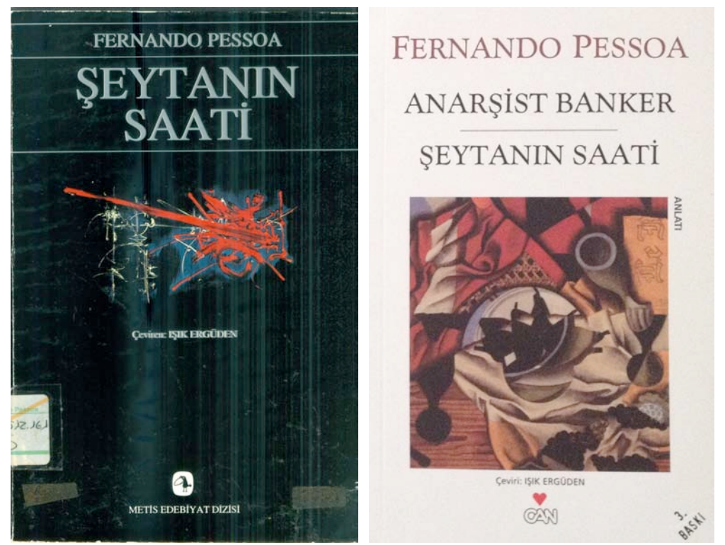
Fig. 2 & 3. Covers of the first edition of Şeytanın Saati ['A Hora do Diabo'] (1993) and of its last available edition, published jointly with the translation of O Banqueiro Anarquista ['Anarşist Banker'] (2006)

translated it in 1989 and 1990 only to see it published in 1993 as Şeytanın Saati by Metis Yayınları following his release from the prison (PESSOA, 1993b; Fig. 2).<sup>5</sup>