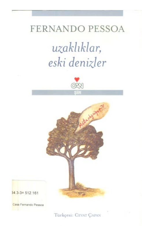
Fig. 5. The cover of uzaklıklar, eski denizler ['distances, old seas'] (2009)

Besides Çapan's endeavors to deliver the poetic complexities of the author in Turkish as completely as possible, Adnan Özer and Rüstem Aslan's edited volume published in 2000, Fernando Pessoa: 20. Yüzyılın Yalnızı ('Fernando Pessoa: The Desolate Man of the 20<sup>th</sup> Century' ), requires special mention (PESSOA, 2000): Özer, a well-known poet who has translated the works of great bards of the Spanish language like Lorca and Paz, and Aslan, whose language of reference is German, put together a list of works among which there are biographical notes for some of the heteronyms, translations from their works and short essays written by various literary critics on Pessoa's projects. The book also contains the translation of Marina Tavares Dias' guidebook to the city of Lisbon as it was during Pessoa's lifetime, supplemented with a detailed photobiography (PESSOA, 2000: 153-181).<sup>9</sup> Such resourcefulness in terms of the utilization of visual material strikes attention in another edited volume published in 2004 as a bilingual catalogue of a special