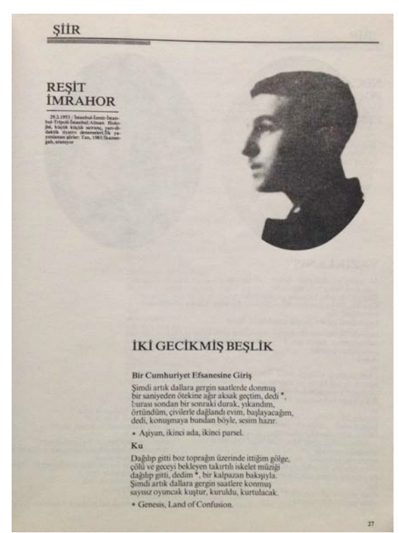
Fig. 1. Pessoa's picture in the 15th issue of the journal Gergedan (1988, p. 27)

And here is the accidental quality: five years before the name Fernando Pessoa and one of the heteronymous works made their debut in Turkish letters, a piece of photograph taken in Pessoa's adolescent days showed up in an influential literary journal called Gergedan ( 'Rhinoceros' ) in 1988 (Fig. 1).