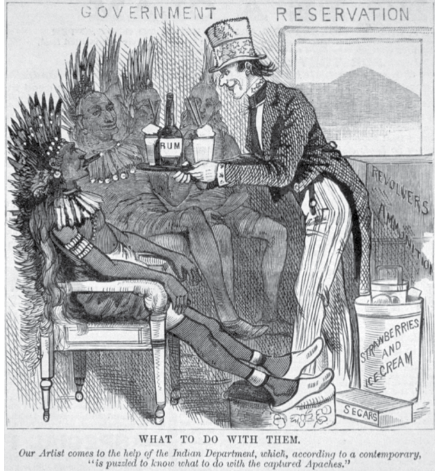
This cartoon from 1883 mocks federal Indian policy, which many in the United States believed pampered hostile groups like the Apache.

own bands. For example, when the Apache took captives from U.S. settlements, U.S. forces would often seize captives from another group, assuming that any Apache leader could coordinate the return of their people. In other cases, they would lash out at the first Indians they came across. Even with the help of Mexican-American guides, many of whom belonged to families that had been fighting the Apache for generations, the U.S. army found it nearly impossible to fight a dispersed and retreating enemy. In the few instances they were able to surprise Apache groups in their campgrounds and communities, they killed men, women, and children alike. The army also sought to destroy Apache homes, crops, and food stores, making their situation increasingly desperate.