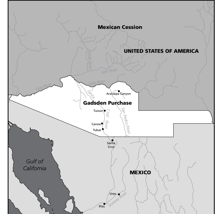
This map shows how the transfer of territory between the United States and Mexico affected southern Arizona. The "Mexican Cession" was land transferred by the Treaty of Guadalupe Hidalgo. Although much smaller, the Gadsden Purchase land transfer had a much greater impact on people living in southern Arizona.

The United States' hunger for land was not satisfied with the Treaty of Guadalupe Hidalgo. U.S. leaders hoped to build a transcontinental railroad with a route through the southernmost part of the United States, and they wanted more of Mexico's northern territory to do it. In 1853, Mexico's President Antonio López de Santa Ana agreed to sell 30,000 square miles of land along the Gila River in exchange for $10 million to support his government. In the Gadsden Purchase, as this sale became known in the United States, Mexico also relieved the