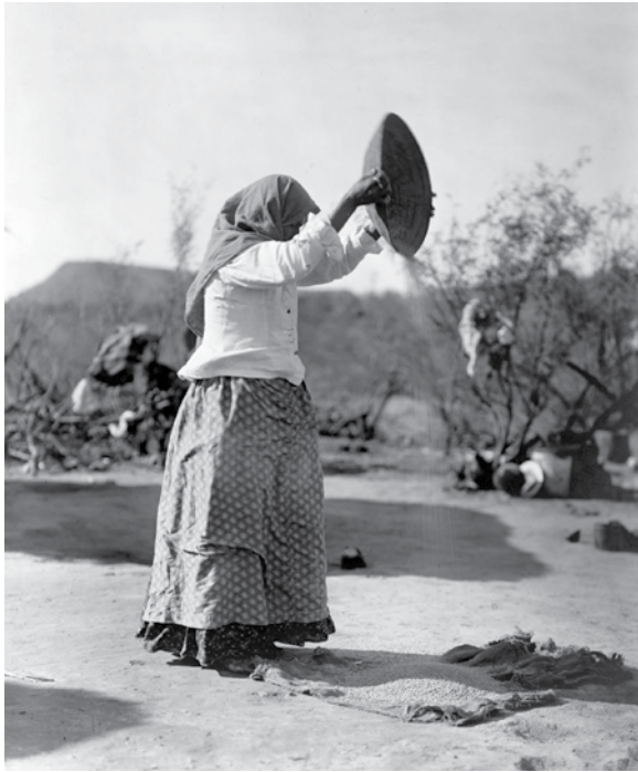
A Tohono O'odham woman prepares wheat grains. Wheat was one of many crops that Europeans introduced to the Americas, and it became a staple crop for the O'odham.

ment gave weekly rations of grain, meat, sugar, tobacco, and other supplies to all Apaches who would settle peacefully near Spanish towns in establicimientos de paz or "peace establishments." In exchange, these apaches de paz or "peaceful Apaches" would be expected to help the Spanish fight Apache groups who were still considered hostile for their refusal to live in the establicimientos de paz .