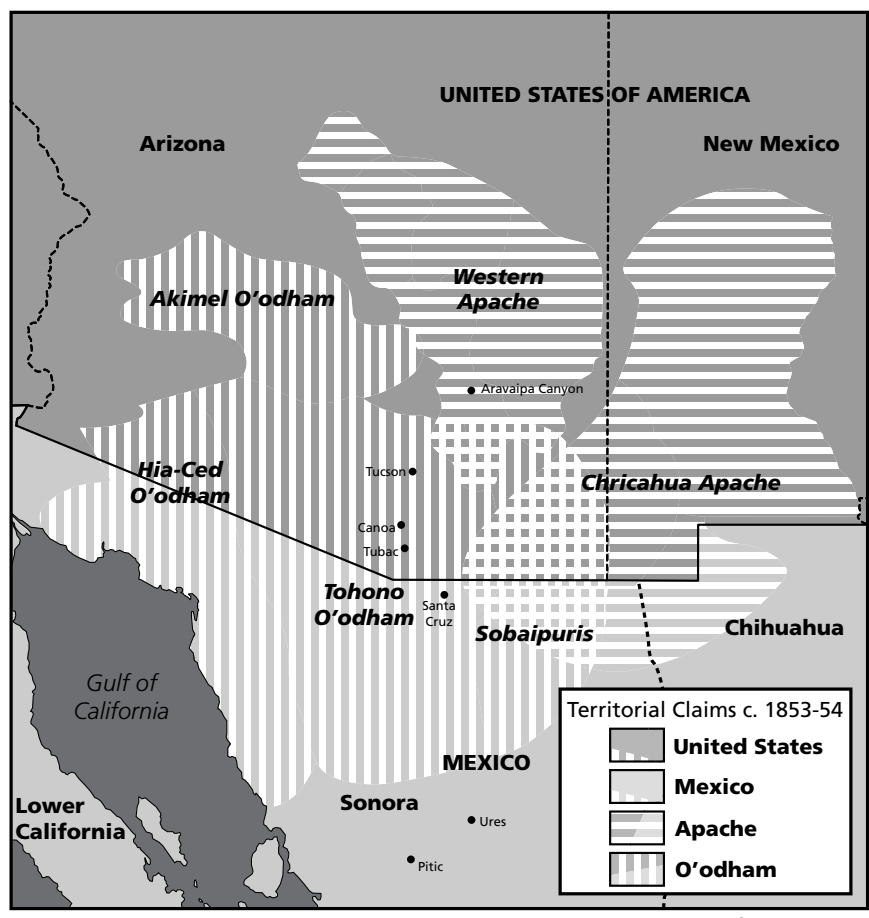
This map shows the region that will be discussed in this section of your reading. O'odham, Apaches, Mexico, and the United States all made claims to land in this region.

Focusing on the local experience allows us to see the ways in which larger themes and events in history affected individuals. Considering history this way is a powerful tool, because it allows us to understand the complex and diverse ways in which history was lived. As you read, think about how the events and policies you read about in Part I affected