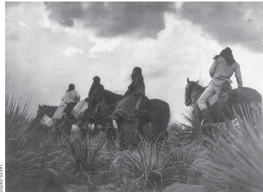
Reintroduced to the Americas by the Spanish in the fifteenth century, horses became an integral part of Apache culture. Many Apache led raids to take horses and other livestock from O'odham, Mexican, and U.S. settlements.

As elsewhere, the Spanish presence was felt long before they settled in the region. Indian trade networks brought European crops, tools, and livestock to the region decades before the Spanish established their first settlements. These networks also brought disease. By the mid-seventeenth century, smallpox, dysentery, malaria, and other diseases had taken a steep toll on local Indian groups, particularly among the O'odham. Outbreaks of disease may have caused villages to collapse and communities to spread across the desert, creating the small band structure that the Spanish observed in the late seventeenth century.