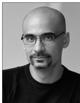
JUNOT DÍAZ Doctor of Letters (Litt.D.)

Junot Díaz is the Rudge and Nancy Allen Professor of Writing at the Massachusetts Institute of Technology and fiction editor at Boston Review . He is the author of the critically acclaimed Drown ; The Brief Wondrous Life of Oscar Wao , which won the 2008 Pulitzer Prize and the National Book Critics Circle Award; and This Is How You Lose Her , a New York Times bestseller and National Book Award finalist.